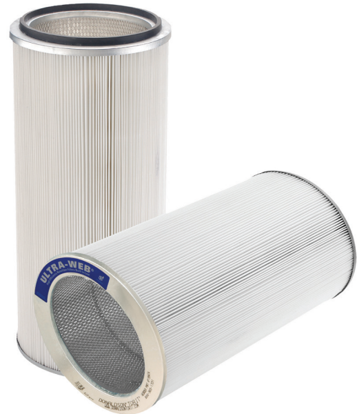
Ultra-Web® SB Cartridge